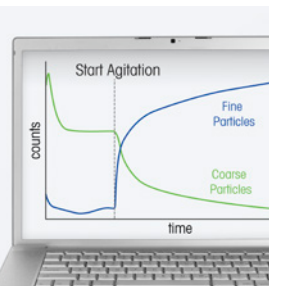
Increase in Scale Changes Process