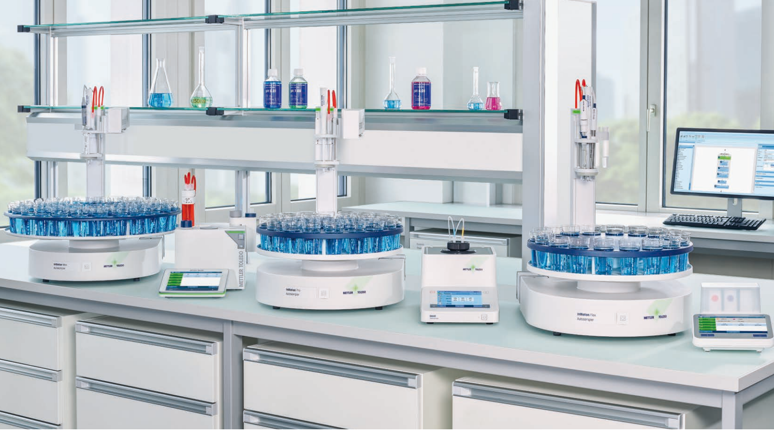
SevenExcellence pH meter with InMotion Flex, RM40 Refractometer with InMotion Pro and T9 Titrator with InMotion Max.