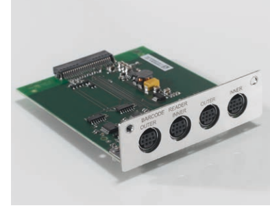
Barcode / SmartSample Option Board