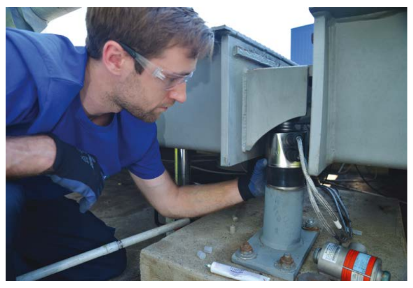
Conversion kits make it easy to upgrade existing vehicle scales POWERCELL® PDX® load cells.

You get a performance upgrade for much less than the cost of a new vehicle scale. Kits include load cells, mounting hardware, and scale terminal. They are available to upgrade older METTLER TOLEDO scales and to convert scales from other manufacturers.