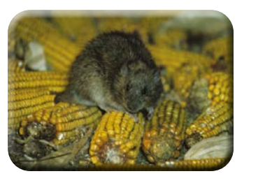
Rodents Stainless steel cables protect against damage from rodents