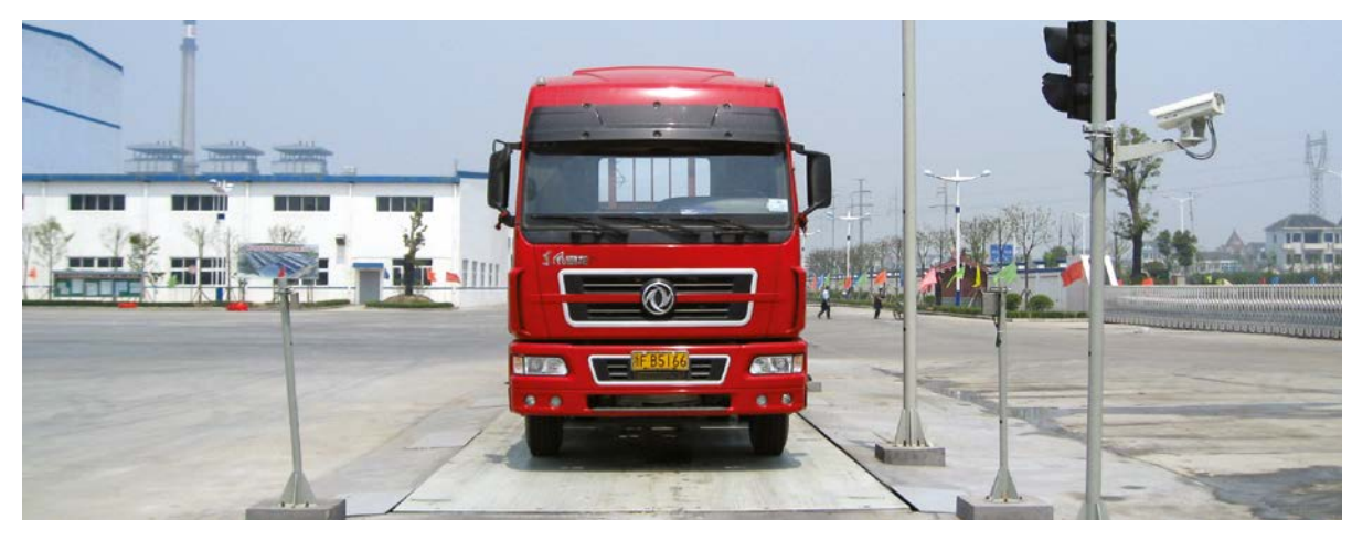
POWERCELL® GDD® load cells use advanced digital technology to provide accurate vehicle weighing at an economical price.