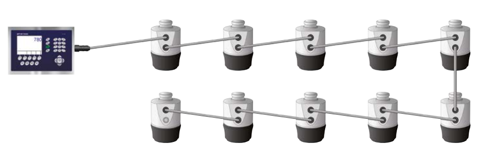
POWERCELL® PDX® Digital Load Cell Network (No Junction Boxes) Load cells and cables are watertight

POWERCELL® PDX® load cells have revolutionized vehicle weighing. With their unique design, they eliminate the weak link of most vehicle scales: the junction box. This simple improvement pays off with lower maintenance bills and less downtime.