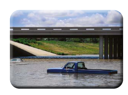
POWERCELL® PDX® load cells passed tests for high-pressure spraying and water submersion